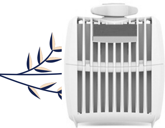
Regular Cartridge 30 Days

When using the Grande cartridge, the dispenser can be programmed to work for 30 days, 60 days or 90 days. The cartridge contains 35 ml of pure fragrance oil, that is approximately 7 times more fragrance oil than a standard metered aerosol can. The fragrance intensity can be changed to a strong (30 days), normal (60 days) or (90 days) mild scent.