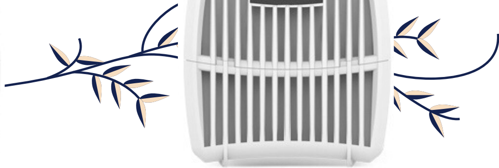
Grande Cartridge 30/60/90 Days

The dispenser automatically detects the Grande cartridge and works as per the chosen setting. The Regular cartridge works for 30 days immaterial of the programmable switch position. The Oxygen-Pro cartridges are available in a wide range of fragrances and are compliant with CARB, EU, IFRA and REACH regulations.